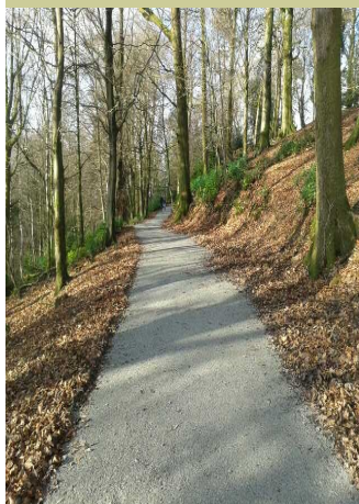
The newly restored Victorian Carriage Drive in Elleray Woods.